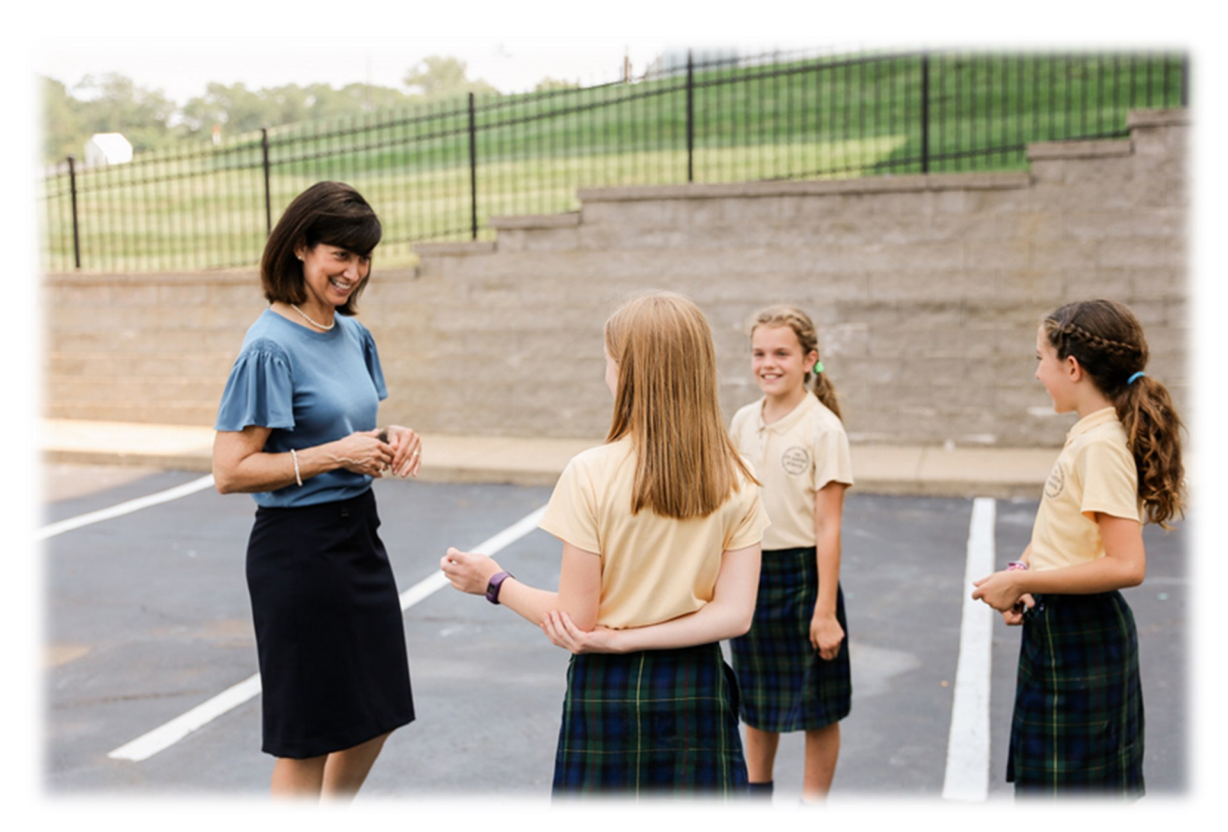
LET THE SERENITY OF YOUR SPIRIT SHINE THROUGH YOUR FACE. Let the joy of your mind burst forth. LET WORDS OF THANKS BREAK FROM YOUR LIPS. ST. PETER DAMIAN