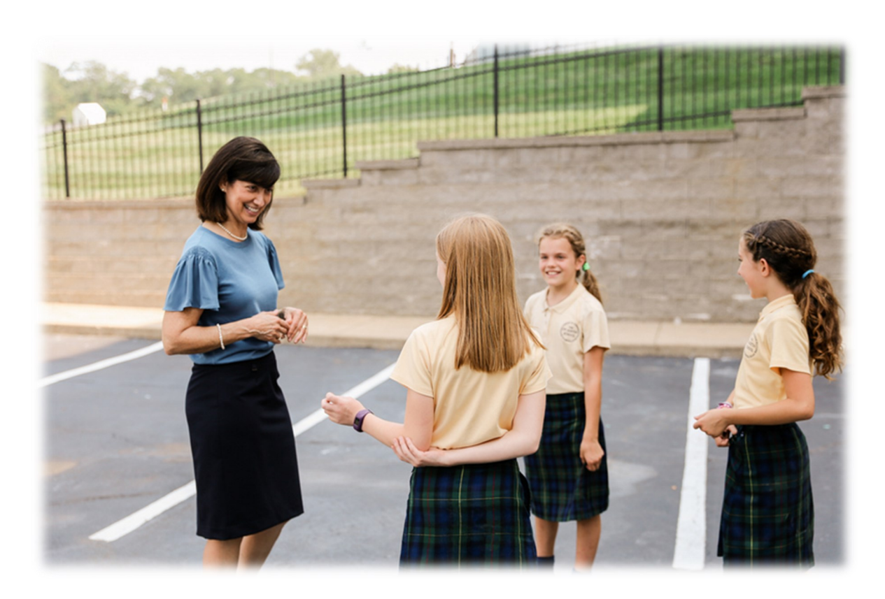
LET THE SERENITY OF YOUR SPIRIT SHINE THROUGH YOUR FACE.